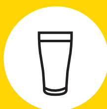
FULL STRENGTH BEER