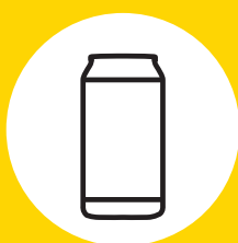
MID STRENGTH BEER